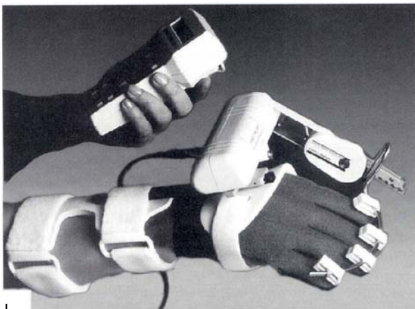
L_ Figure 1

The literature is overwhelmingly supportive of the adverse effects of prolonged immobilization of synovial joints 1 . Post surgically, intermittent motion enhances the biological healing response, and continuous motion does even more so 2 . Continuous passive motion (CPM) is a treatment modality used to provide the benefits of early controlled motion following surgery or injury of the upper or lower extremity (see figure 1). After years of experimental and clinical research, Dr. Robert Salter concluded that CPM is well tolerated, has a significant stimulating effect on the healing of articular tissues, prevents adhesions and joint stiffness and influences regeneration of articular cartilage 2 . Early continuous motion takes tissues through their normal ROM to ensure that they heal in an elongated fashion 3 . While CPM preserves ROM that is at risk of being lost, keep in mind that "motion never lost need never be regained" 3 .